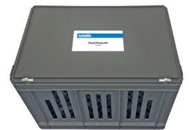
FILTER TANK WITH LID