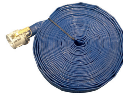
DISCHARGE PIPEWORK, 20m