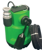
SUBMERSIBLE PUMP (FULLY AUTOMATIC)