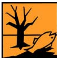
Dangerous for the environment